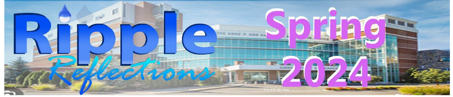
For April, May & June 2024, Vol. XX